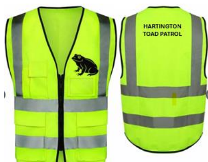
Phillip Neal, Hartington Wildflowers

Our Mere toad patrol is standing by ready to go, aided by the fabulous Hartington Toad Patrol Hi Viz jackets. Volunteers will patrol typically around dusk, ensuring that any amphibians found on the road are safely returned to either the water or grassy areas depending on direction of travel! If you are interested in taking part, please get in contact.