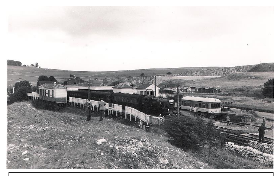
Hartington Station, 4-9-1962, one of the last passenger-carrying trains.