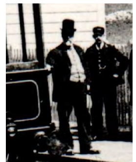
Francis William Webb

Hartington was quite a grand example of rural station architecture, soundly constructed with, for example, Canadian Red Cedar timber for the platforms. The picture displays its resplendent character on the line's opening day, 1 st August, 1899.