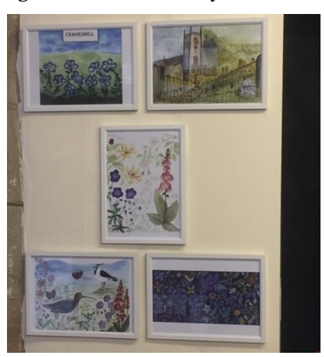
Wildflower paintings in the Bakehouse

Wildflowers in Hartington as we move into the summer months, we are now starting to see the gradual emergence of wildflowers in each of our planting areas which is really encouraging – as this is our first year, we expect to learn a great deal that will hold us in good stead for future years.