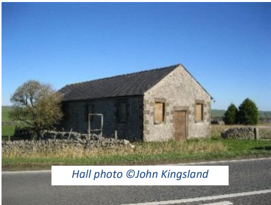
Hall