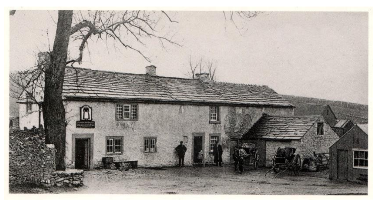
The Quiet Woman Inn 1891

If you have any more interesting information about this wonderful Inn please send to Liz@broomhead.net The October Derbyshire Life will have an article covering The Quiet Woman – a unique Derbyshire Pub